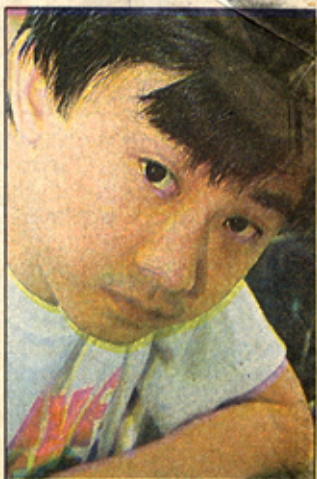
The Return Of The Hermit ... drawn by Wee Tian Beng.